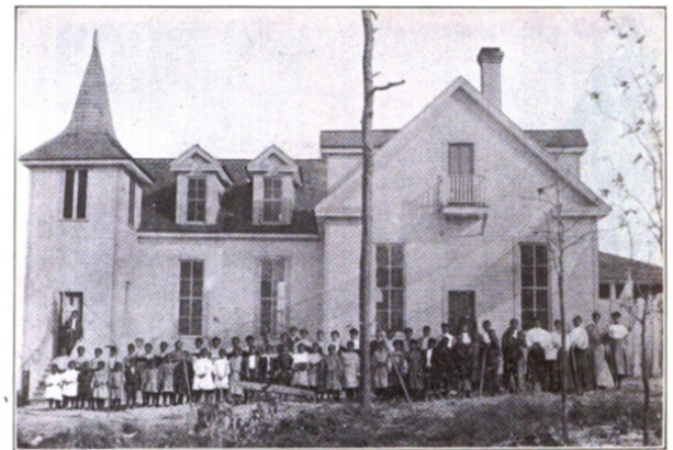
SARAH LINCOLN ACADEMY