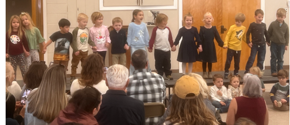
Merry Hearts Annual Thanksgiving Day Program