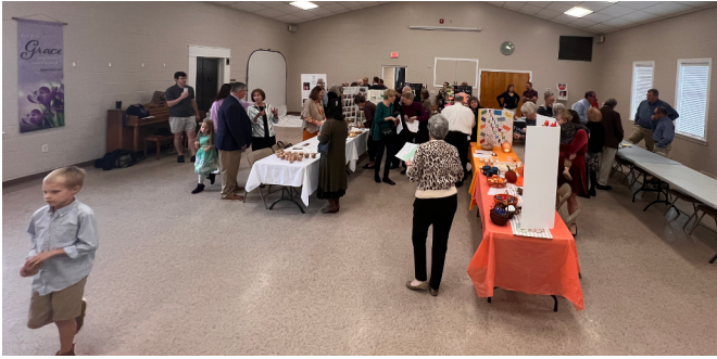
2024 Time & Talent Fair